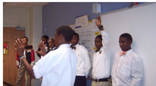
Business Essential students participate in a Team-work activity at B.E.S.T. Academy High School.